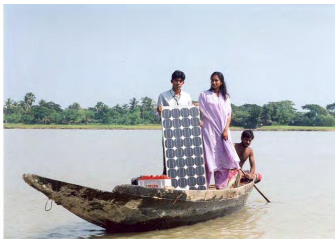
Fig 1.3 Solar Technology for Island Dwellers in Bangladesh

These challenges can be met by increasing energy efficiency through innovations in technology and processes, as well as by increased use of renewable energy, resulting in lower emission increases and eventually, in emission reductions.