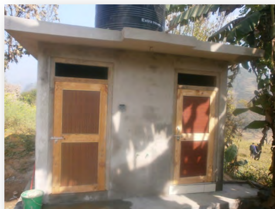
Fig 5.4.3 Toilet and water tank built after Hydram installation