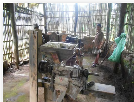
Fig 5.4.8 Rice huller integrated with IWME