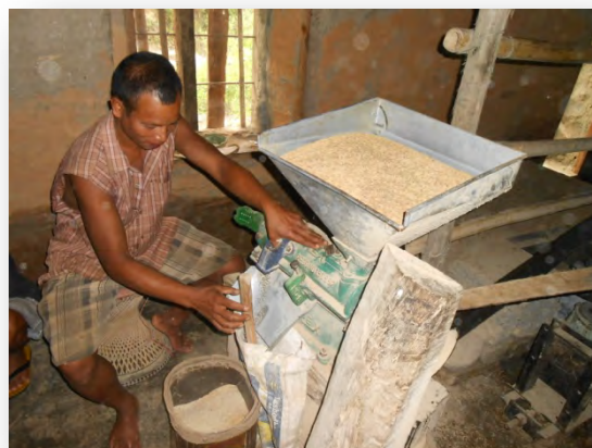
Fig 5.4.7 Paddy processing in rice huller

The processing speed of IWME is similar to that of a diesel mill, which is two Muri of paddy/hour. The presence of an IWME system in the community has led to reduction of the use of fossil fuel to process agro-products, which means the emissions associated with the agro-sector have also been reduced through use of the improved water mill. From the mill owner's perspective, he will no longer need to travel to the city center to buy diesel at a cost of 115 Rs/liter. Not having to fetch diesel fuel has been a relief to the owner, as it has enabled him to save the time and energy spent on