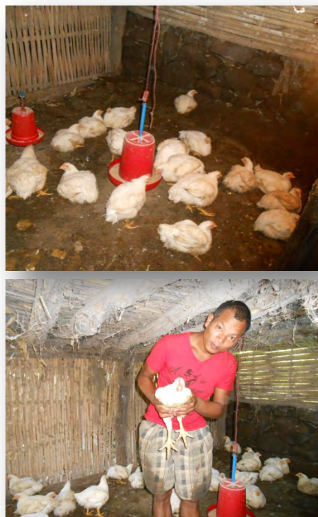
Fig 5.4.5 and 5.4.6 IWMEChicken houses and Chicken Man

Each batch of chicks requires 45-60 days to turn into adults. and then they are sold in the market. The chickens are consumed in his own village, as there are lots of meat lovers in his community. He sells the chickens at the rate of 250 per kg (the average weight of one chicken is 2.5 kg). So, from one batch of chickens, he makes a profit of approximately NPR 11,000 providing an important boost to his previous income.