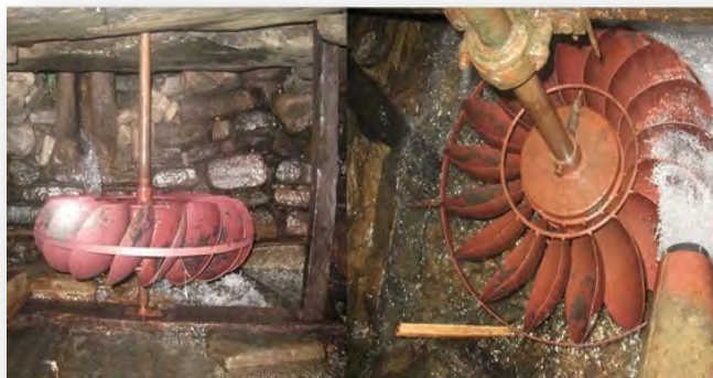
Fig 5.4.4 Improved water mill

The Improved Water Mill technology complements the essence of the eco-village development concept. Not only is it a source of clean energy, it also has cobenefits that can enhance rural livelihoods. It is ideal for the hilly terrain of Nepal, which has plenty of water resources and enough height for the system to work. Over the last few decades, many changes have been made to the technology, making it more efficient, time-saving, and versatile in use. The Center for Rural Technology, Nepal (CRT/N) has implemented an enhanced version of the technology, known as the Improved Water Mill Electrification (IWME) system. This is being used for rural community electrification and to integrate micro-enterprises that use electricity generated from IWM. Importantly, much training on income-generation solutions is also integrated into the programme.