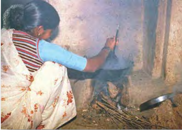
Fig 4.5. Cooking on 3-stone

Women cooking in the smoky kitchen said: