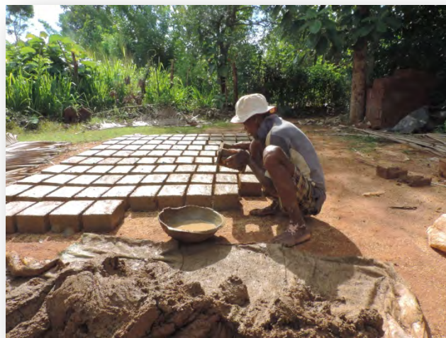
Fig 5.3.1 Dharmaratne making bricks with rice husk brick mixture

This new kiln has permanently constructed walls at three sides, a roof, and three firewood openings. Importantly, both firewood and rice husk can be used as firing fuels. This kiln also has additional firing channels. With the upgraded procedures, the stacking of bricks inside the kiln is done systematically with interlayer gaps to be filled with paddy husk to improve the heat circulation and to get the maximum heat benefit. The improvements in the brick kilns has reduced the consumption of firewood substantially, creating additional economic benefits for brickmakers such as Dharmaratne while also reducing tree-felling for firewood. This, in turn, has eliminated