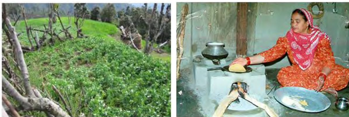
Fig 2.1 Smokeless Stoves and Organic Gardening are part of the Eco-Village Development Concept

The Eco-Village Development concept involves the implementation at village-level of appropriate, inexpensive renewable-energy technology (RET) and capacity-building activities for climate-change adaptation and mitigation. It takes a collaborative approach by involving community members deeply in planning and implementation, while also giving them the tools to be resilient while facing climate change. EVD is an integrated approach of creating development-focused, low-carbon communities of practice in existing villages. The bundle of practices includes mitigation technologies like small, household-sized biogas plants, smokeless stoves, solar-energy technology, improved water mills to generate electric power, stand-alone systems like pico-/micro-hydro power for rural electrification, and solar-powered drying units. It also includes adaptation technologies such as organic farming, roof-water harvesting, water-lifting technologies like hydraulic ram pumps, and other solutions.