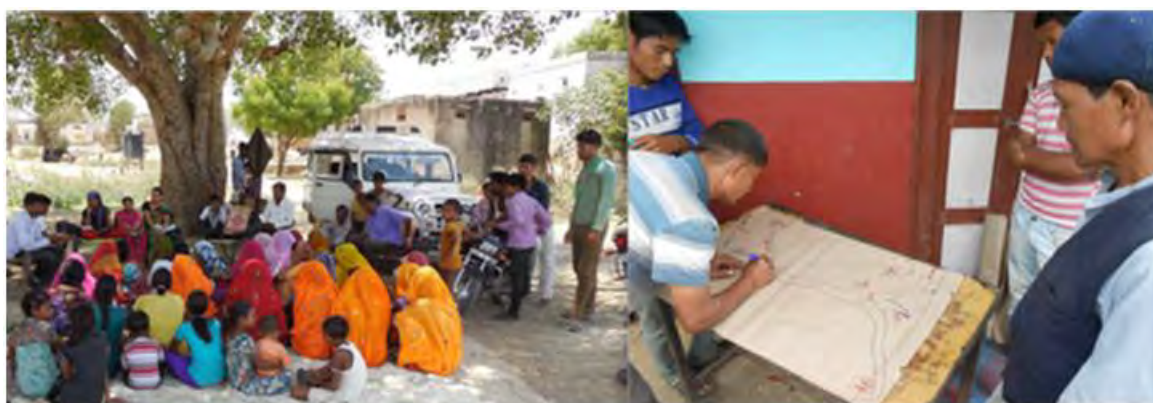
Fig 3.1 Villagers meeting and roadmap planning for policy makers