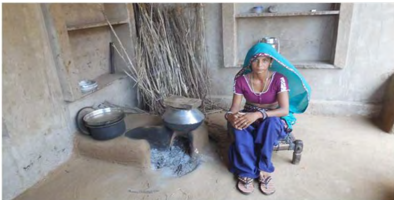
Fig 1.1 Traditional wood-fired cookstove in rural India

1.56 billion people in South Asia struggle for access to energy, sanitation, safe drinking water, nutrition, and health services (UNDP, 2014). Climate change makes the situation grimmer, since by the 2050s it could decrease the cultivation area of high-yielding wheat by 50% due to heat stress in the Indo-Gangetic plains. This can have severe effects on food-crop productivity by affecting the rice-growing regions of India and Bangladesh, which are also affected by inundation from rising sea-levels. The yields of maize and sorghum, grains commonly consumed by the poor, also could decrease by 16% and 11%, respectively. This could spell trouble for South Asian countries, which have a massive responsibility to eradicate multi-dimensional poverty and to safeguard extremely vulnerable populations from the catastrophic effects of climate change.