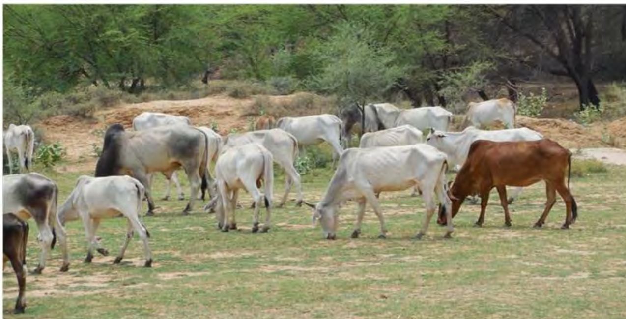
Fig 1.2 Potential for Biogas Energy

On the basis of Purchasing Power Parity (PPP), South Asia energy intensity is lower than the world average, including the United States and China. Energy intensity is based on commercial fuels. These low numbers also reflect a high proportion of non-commercial energy, e.g., traditional biomass, etc.