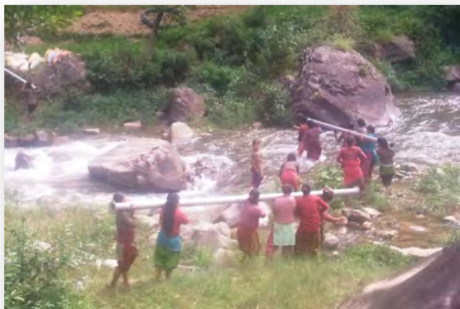
Fig 5.4.2 Women's contribution towards the implementation of the hydram project

The collective impact of this development has been felt the most in the status of women in the Nepalese community at Sanigaun-5, Balthali. Not only has the project improved women's communication skills, it also has given them greater confidence, leadership, and decision-making capacities.