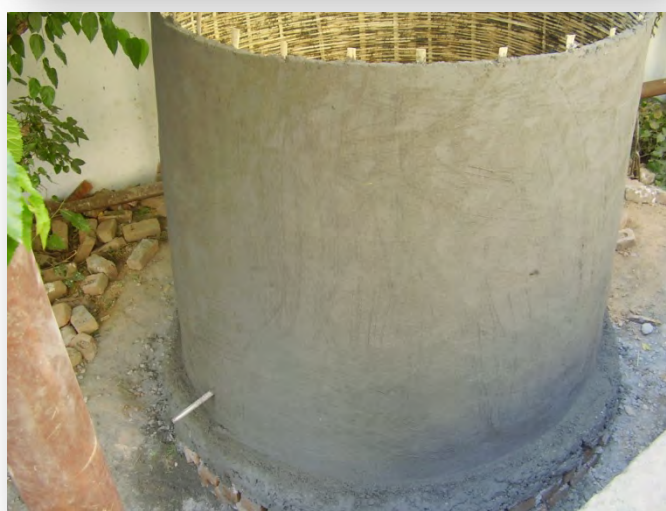
Fig 5.2.6.1 and Fig. 5.2.6.2 Bamboo-cement based rain water storage tank under construction