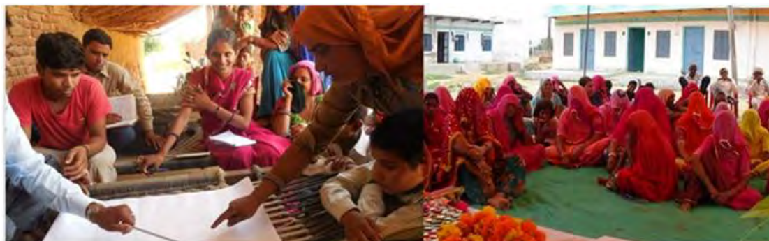
Fig 2.3 Active participation of villagers in project development in India

The key to success for any development project is the active participation of local communities, sub-communities, and rural households.