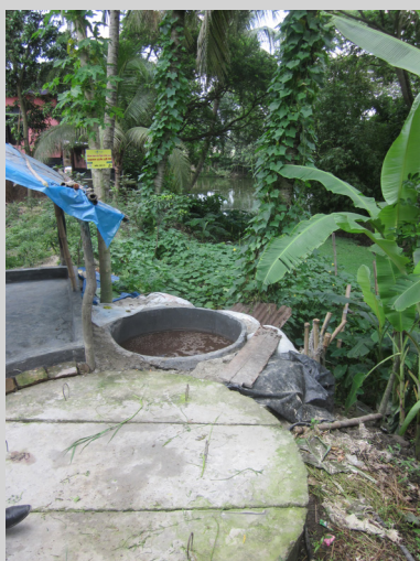
Bamboo-made slurry pit

Under the EVD project in Bangladesh, 4 Solar street lights (20 Wp each) have been set up in the off-grid village Khowamuri of Singair Sub-District of Manikganj. Villagers receive lighting from sunset until dawn. Villagers' gatherings are also more frequent at every street light. Moreover, women can move easily and continue domestic activities with street light as well.