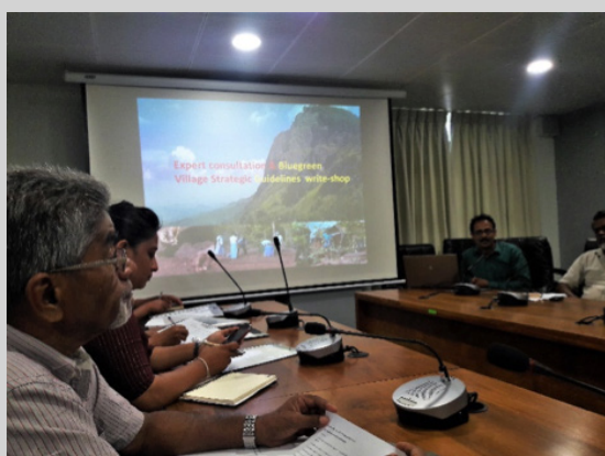
Expert consultation on Guideline Development for Bluegreen villages

The Bluegreen villages programme in Sri Lanka, is being nationally co-ordinated by the Ministry of Mahaweli Development and Environment of Sri Lanka and the initial key collaboration with EVD came under the event “National Dialogue on Sustainable Eco Village Development in Sri Lanka” which was co-organised by IDEA in July 2017. The dialogue paved the way to share experiences of the Bluegreen, EVD programme and other similar initiatives at a common platform. Since then EVD experiences, findings have been extensively shared with the ministry. The discussions from