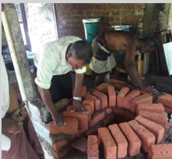
Capacity building demonstration on institutional stoves

the other to develop guidelines. Moreover, IDEA has submitted recommendations for further development of the Bluegreen concept in Sri Lanka, giving light to key learnings, approaches and solutions adopted in the EVD concept. These recommendations have being acknowledged by the ministry. In taking this collaboration forward IDEA is to organize a consultation event with the Ministry of Mahaweli Development and Environment to enhance national Bluegreen village guidelines in April 2018. In the meantime EVD capacity building activities and demonstrations are successfully carried out in the Matale District with collaborative inputs from Matale local government.■