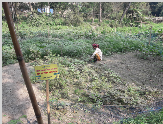
Home gardening initiative

The EVD solution provides a model for a community-based school with clean drinking water as well as light within a sustainable framework.